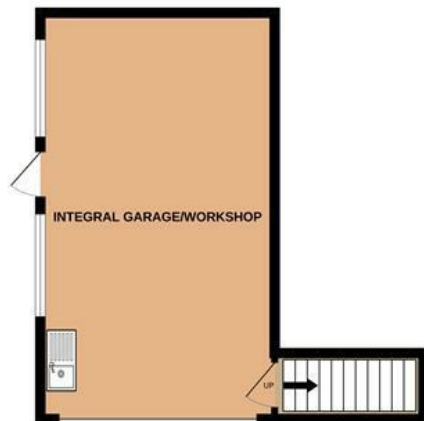
2ND FLOOR 332 sq.ft. (30.8 sq.m.) approx.