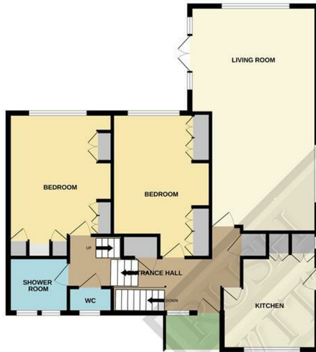
GROUND FLOOR 1012 sq.ft. (94.0 sq.m.) approx.