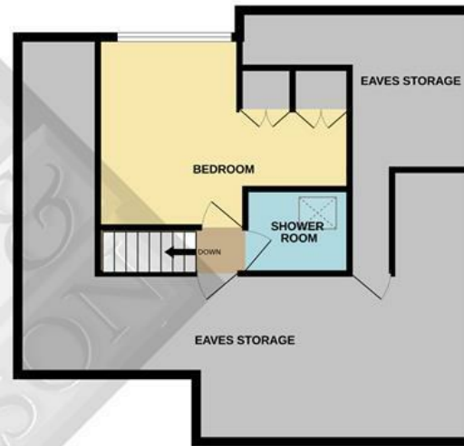
1ST FLOOR 686 sq.ft. (63.8 sq.m.) approx.